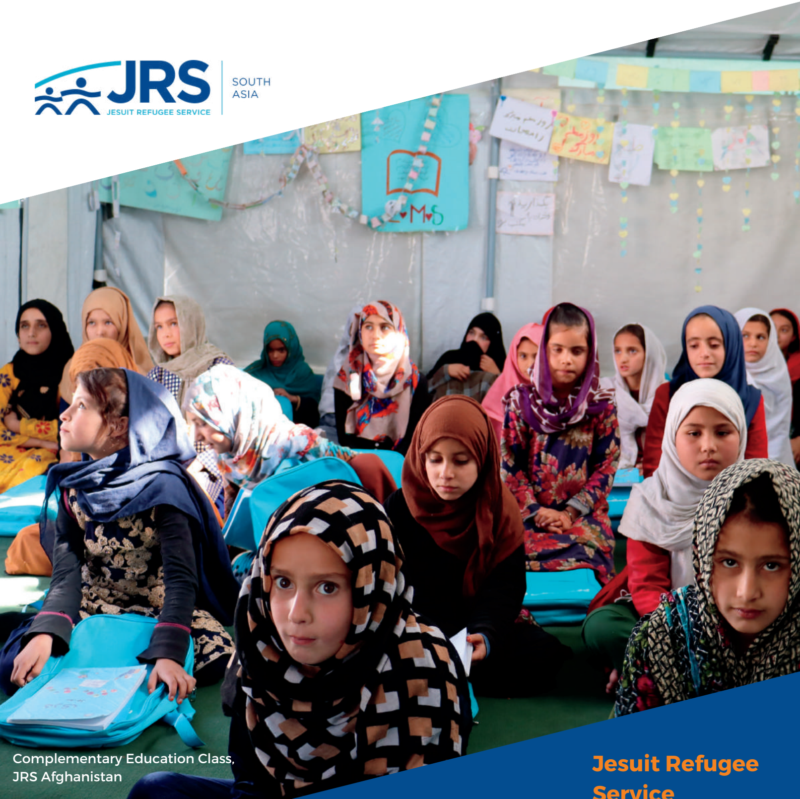
Complementary Education Class, JRS Afghanistan