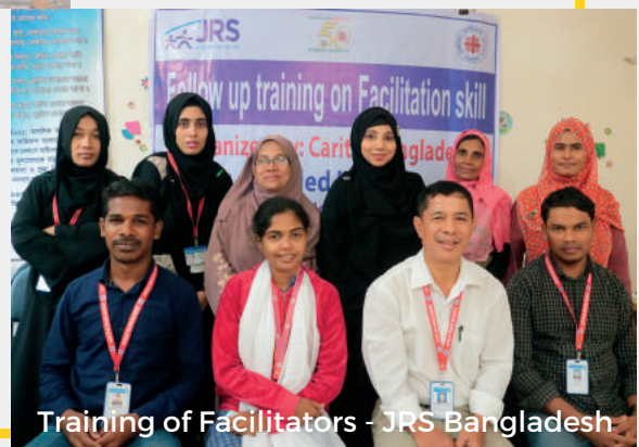
Training of Facilitators - JRS Bangladesh