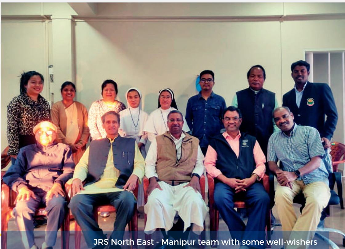
JRS North East - Manipur team with some well-wishers

JRS in partnership with JRS USA and with the funding provided by the United States government (PRM) will accompany the Burmese PoC to promote the enrolment and continuation of formal education for unregistered dropout Burmese children under the National Education System (NES) through supplementary education courses and to improve access to psychosocial wellness and social support for the most vulnerable PoC through Mental Health and psychosocial and Reconciliation supports.